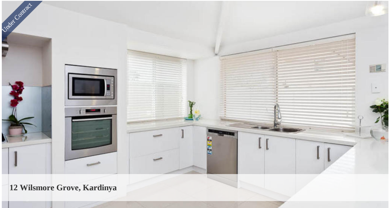
12 Wilsmore Grove, Kardinya