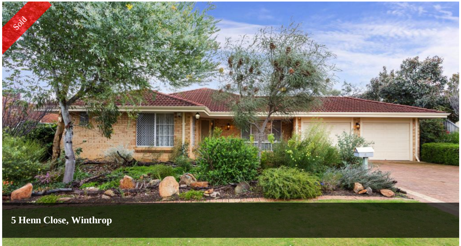
5 Henn Close, Winthrop