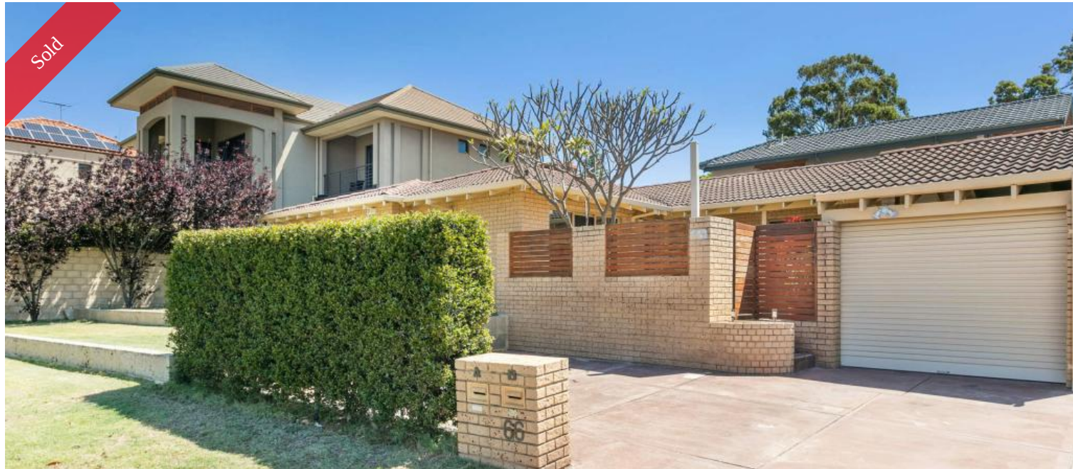
66A Bateman Road, Mount Pleasant