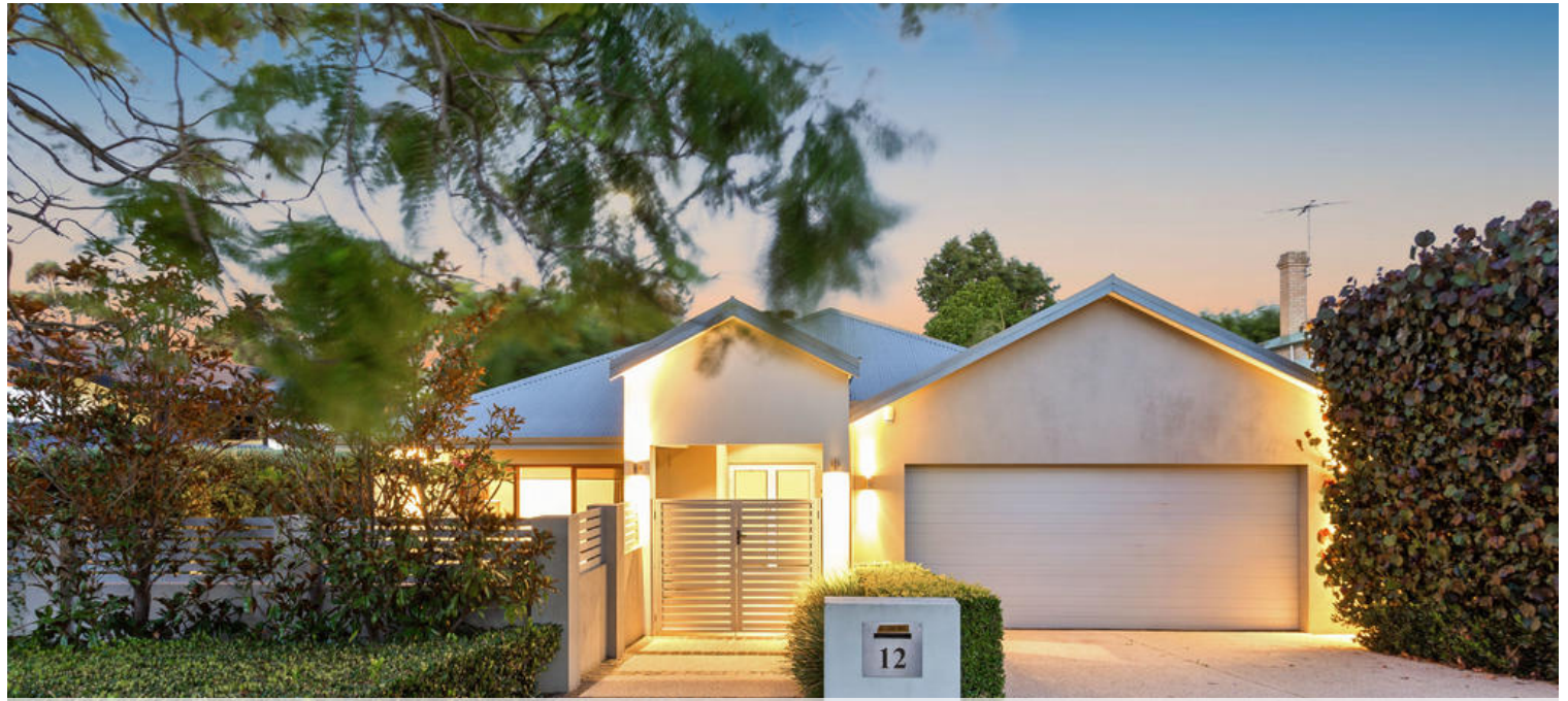
12 Nisbet Road, Applecross