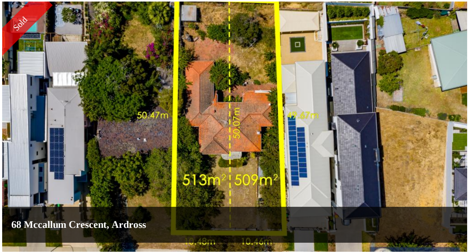
68 McCallum Crescent, Ardross