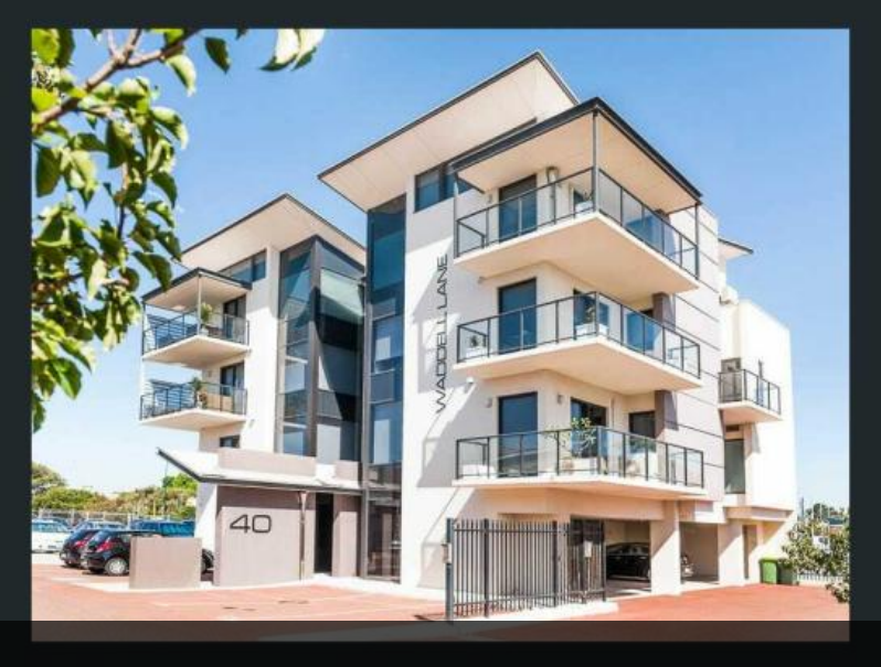
Suite 8/40 Waddell Road, Bicton