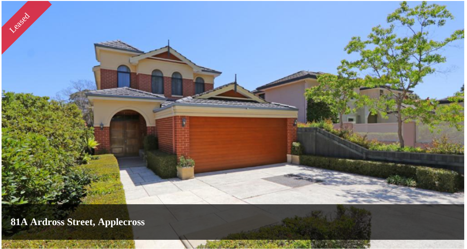
81A Ardross Street, Applecross